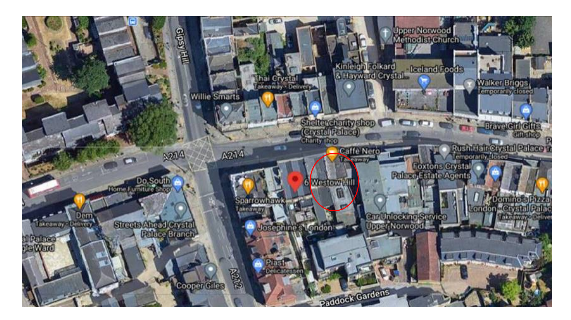
Figure 2: Aerial street view highlighting the proposed site within the surrounding streetscene