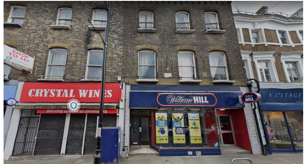
Figure 1: the frontage of the site.

3.3 The application site is located on the southern side of Westow Hill. The building comprises of a three storey building which forms part of a terrace of buildings. The property has a dual pitched roof with gable ends. The existing building is immediately adjacent to the back of the pavement edge.